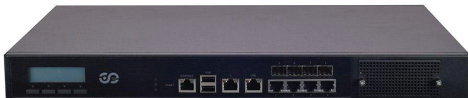
Figure 1. Front view of Lanner NCA-2510

128 Technology has teamed up with Lanner to develop a uCPE that combines its software running on Lanner white box servers. Several of Lanner's servers powered by Intel Atom® C3000 processors and Intel Atom C2000 processors can be utilized for this uCPE application. The most flexible system is the Lanner NCA-2510, a virtualization-optimized 1RU-high server that utilizes Intel Atom C3000 processors and is available with between 4 and 16 cores and up to 32 GB of memory. The NCA-2510 supports up to four 10 GbE small form-factor pluggable (SFP+) optical connections in addition to a four-port Intel® Ethernet Server Adapter I350 Gigabit Ethernet controller. The NCA-2510 leverages other Intel technologies including single root input/output virtualization (SR-IOV), Intel® Advanced Encryption Standard New Instructions (Intel® AES-NI), and Intel® QuickAssist Technology (Intel® QAT). Combined, these technologies give the device the features and throughput for vCPE, uCPE, SD-WAN, and software-defined security applications.