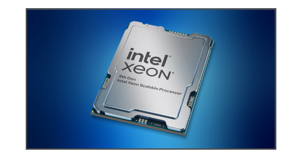
Figure 2. 5th Gen Intel Xeon Scalable processor.

5th Gen Intel Xeon Scalable processors support the latest in platform technologies including DDR5 memory for the highest memory bandwidth, PCIe 5.0 for I/O connections between the CPU and devices, and Compute Express Link 1.1 low latency I/O.