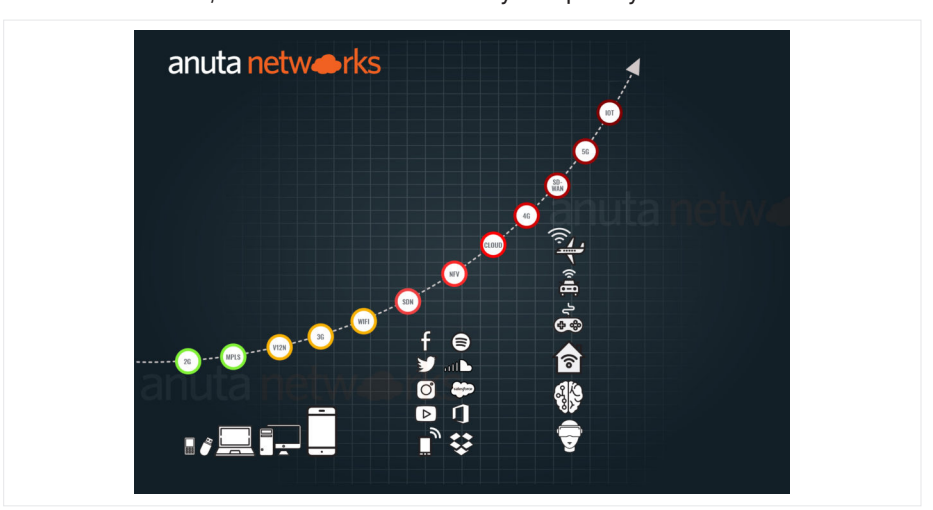
Figure 1. Illustrates the new network applications and functions that are adding complexity to the network and also how the network has evolved from 2G and MPLS to 5G to respond to this changing environment.<sup>1</sup>

New streaming services and internet of things (IoT) applications are grabbing headlines, but buried in the details is the impact these new technologies are having on the network. Bandwidth-intensive, real-time services like streaming video, online video games, and augmented reality/virtual reality (AR/VR) consume massive amounts of bandwidth and require low latency. Emerging IoT applications use relatively little bandwidth per device but typically have very large numbers of connected devices, which creates connectivity complexity.