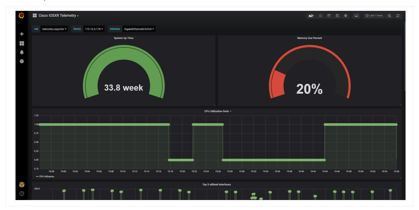
Figure 3. Grafana dashboard example.

Closed Loop Automation: Network administrators can use the data collected by ATOM to define baseline behaviors for their network and set remediation actions to be initiated on any violation of any of these behaviors. ATOM's correlation engine constantly monitors and compares the collected data with the baseline behavior to detect any deviations. On any violation, the pre-defined remediation action is triggered in order to maintain network consistency. The solution simplifies troubleshooting by providing the context of the entire network. Customers can define key performance indicators and corrective actions to automate SLA compliance.