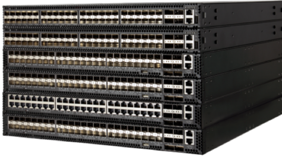
Figure 2. Edgecore AS5900 Open Switch. 2

Edgecore Networks delivers open network solutions for cloud data center, telecommunications, and enterprise customers. Edgecore, as a participant in the Open Compute Networking Project,* offers a full set of open switches based on its approved design contributions.