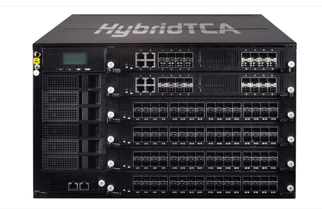
Figure 1. Lanner HTCA-6600.

The HTCA-6600 has a scalable and modular architecture that provides compute and storage along with network switching to deliver robust and more secure edge services with elastic capacity. The platform features up to six dual-CPU blades (HMB 6110), supporting up to 12 Intel<sup>®</sup> Xeon<sup>®</sup> Scalable processor CPUs with a total of 336 physical cores.