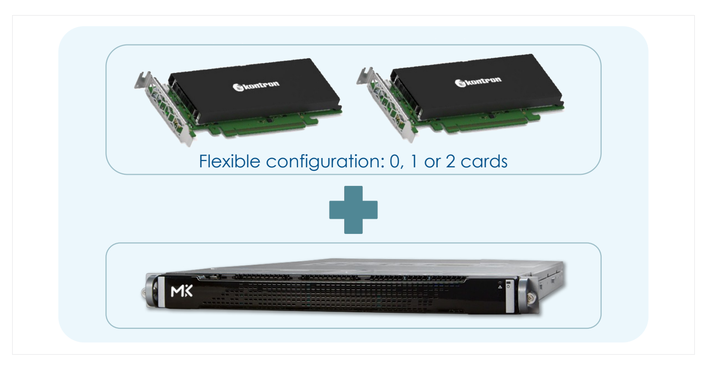
Figure 2. Configuration options for G8 series server.

The G8 series is built using the 3rd Gen Intel Xeon Scalable processor family with between 8 and 40 cores and a wide range of frequency, feature, and power levels. In addition to video transcoding applications, the CPUs are designed for cloud, enterprise, HPC, network, security, and IoT workloads. This processor family offers enhanced gen-over-gen performance and built-in AI acceleration for faster analytics, processing of more images or video streams, and more powerful AI in edge and IoT deployments. Built-in hardware-based security protects critical code and private data from tampering or interception by malware or hackers, a particular challenge in dispersed edge, industrial, or IoT deployments.