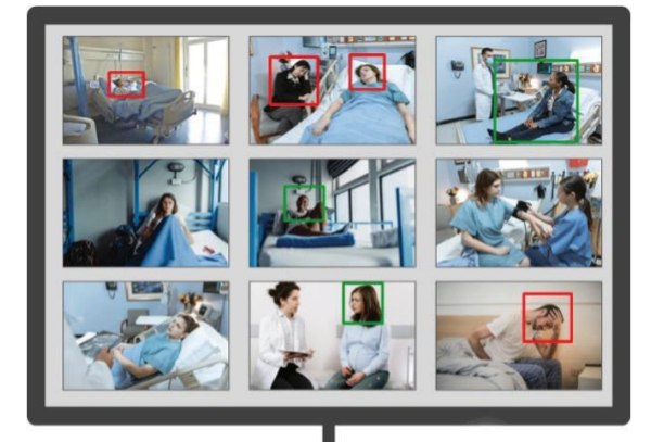
Figure 1. Video intelligence for inpatient monitoring and assessment.

Forward-looking providers of patient monitoring solutions are seeking to expand the degree of insight that data generates about each patient. Applying deep learning algorithms to video feeds and traditional patient monitoring data can deliver a more complete patient status to clinical caregivers, as shown in Figure 2. The three aspects of visual intelligence for inpatient monitoring are discussed in the remainder of this section: data fusion, scene intelligence and digital twins.