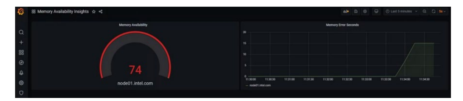
Figure 3. Grafana Dashboard Visualizing Two Memory Report

Streaming Telemetry Insights Provider gives real-time platform insights in a streaming environment. This is where telemetry is collected from the platform, insights calculated, and results made available to the end-user in one continuous stream. Streaming Telemetry Insights Provider is built as a Kafka Streams application, where it subscribes to a telemetry stream in a Kafka cluster in one real-time continuous stream. In addition to the real-time insights, the Streaming Telemetry Insights Provider also delivers alerts when KPI thresholds are exceeded. All insights provided fall into the four categories of health, utilization, congestion, and platform configuration. See <a href="Figure 3">Figure 3</a>. Note that similar insights can be found in Telemetry Insights Provider and Streaming Telemetry Insights Provider; they are just two different methods of delivery.