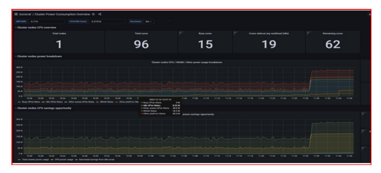
Figure 4. Grafana Dashboard of Cluster Power Consumption

<u>Figure 4</u> illustrates a simple Grafana dashboard visualizing the Cluster Power Consumption Overview. This gives an overview of the telemetry collection of all the servers in the cluster.