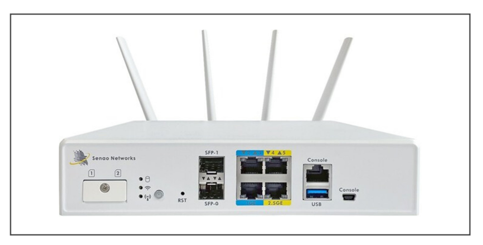
Figure 1. Senao SA9820 front view.

The Senao SA9820 is a SASE-enabled network desktop appliance for edge deployment. The system is based on the Intel Atom x7000RE processor series for the Edge. The SA9820 provides ample network I/O ports including two ports of 1GbE Base-T, two ports of 2.5GbE Base-T, and two ports of 1GbE SFP connection for network connectivity. The SA9820 uses an external power adapter.