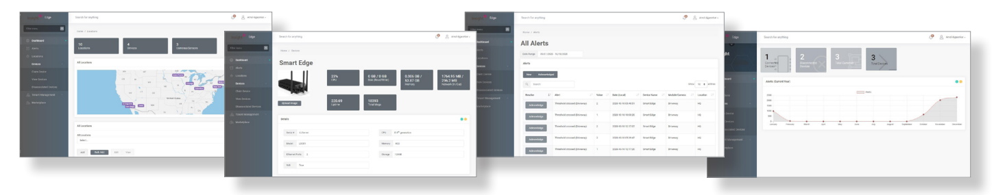
Figure 3. The Insight Edge dashboard helps manufacturers easily monitor equipment performance across multiple locations.

Employee safety can also benefit from an Intelligent Edge. Al-enabled computer vision systems can actively prevent accidents by providing automatic shutdown of systems and reducing severity through advanced notification.