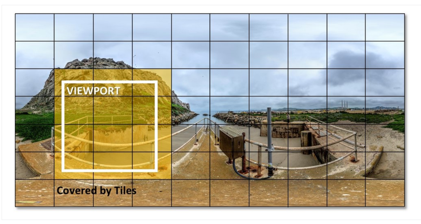
Figure 1. Image shows the viewport that is present on a VR device as a portion of the overall available image. Tiled streaming serves just the tiles needed for the viewport.<sup>1</sup>

This low resolution is increased when using 8K video. An 8K VR stream generates an 8,192 x 4,096 pixel image, yielding a viewport of about 2,000 x 2,000 pixels per eyes considerably better.