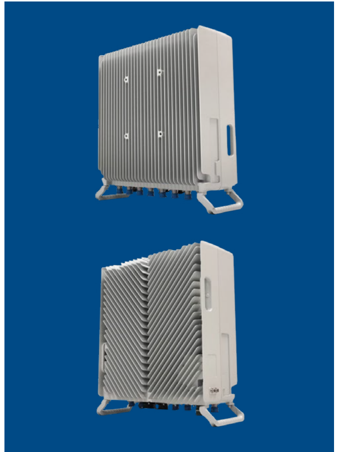
Figure 3. Viettel High Tech's macro cell solution, from posterior and anterior angles.