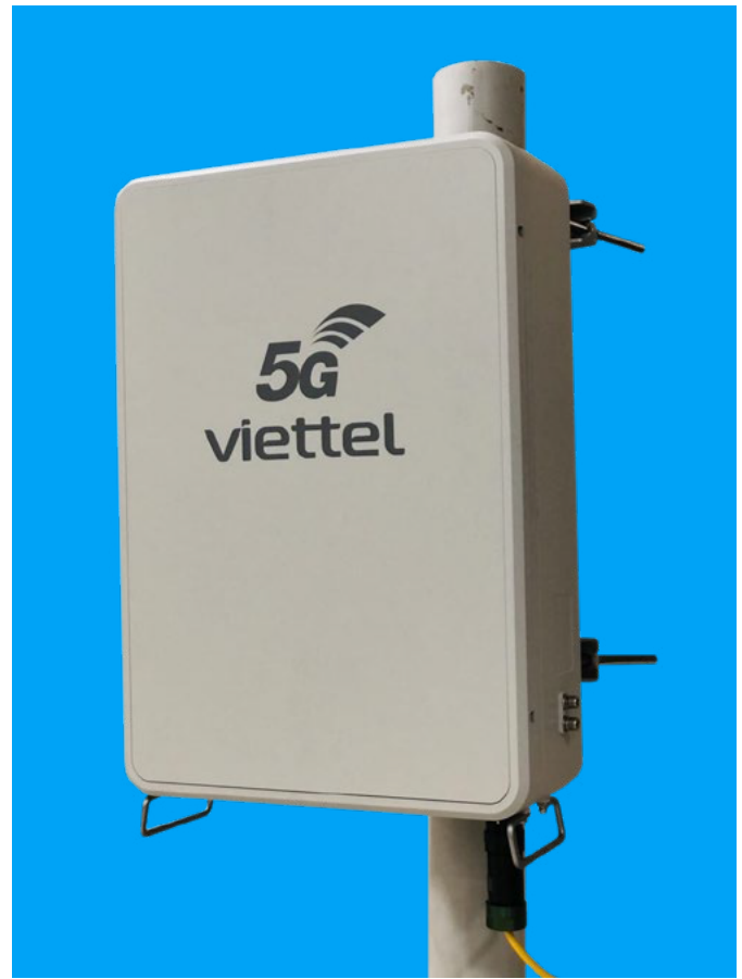
Figure 2. Viettel High Tech's micro cell solution.

Viettel High Tech used the Intel® FPGA PAC N3000 to accelerate FEC in the Layer 1 processing. FEC is used to correct errors in transmission without requiring retransmission, which is fundamental to 5G. The N3000 is a SmartNIC platform based on an Intel® Field Programmable Gate Array (Intel® FPGA), which enables program logic to be implemented in hardware. The Intel® FPGA PAC N3000 product family includes a variant that is designed to be Network Equipment Building System (NEBS)-friendly, for use in central offices. The Intel® FPGA PAC N3000 enables high throughput, low latency and low power per bit for a custom networking pipeline.