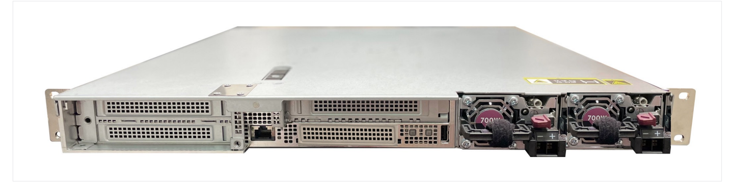
Figure 2. HPE's ProLiant DL110 Gen10 Plus Telco Server.

The server is built for edge deployment, featuring openstandards architecture and a carrier-grade ruggedized Network Equipment-Building (NEBS) Level 3-compliant platform. The rack-mounted server is a compact 1U high, minimizing physical infrastructure demands in the remote environment.