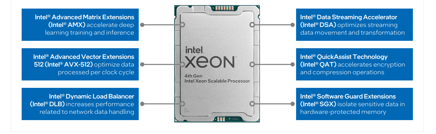
Figure 4. Key accelerators built into the 4<sup>th</sup> Gen Intel® Xeon® Scalable processor.

The company worked closely with Intel to optimize resource consumption in Wind River Studio running on 4<sup>th</sup> Gen Intel<sup>®</sup> Xeon<sup>®</sup> Scalable processors, which resulted in the ability to run the entire cloud software platform in a single core – half the core count required for software to run on 3<sup>rd</sup> Gen Intel<sup>®</sup> Xeon<sup>®</sup> Scalable processor. This frees up a core for other revenue generating applications.