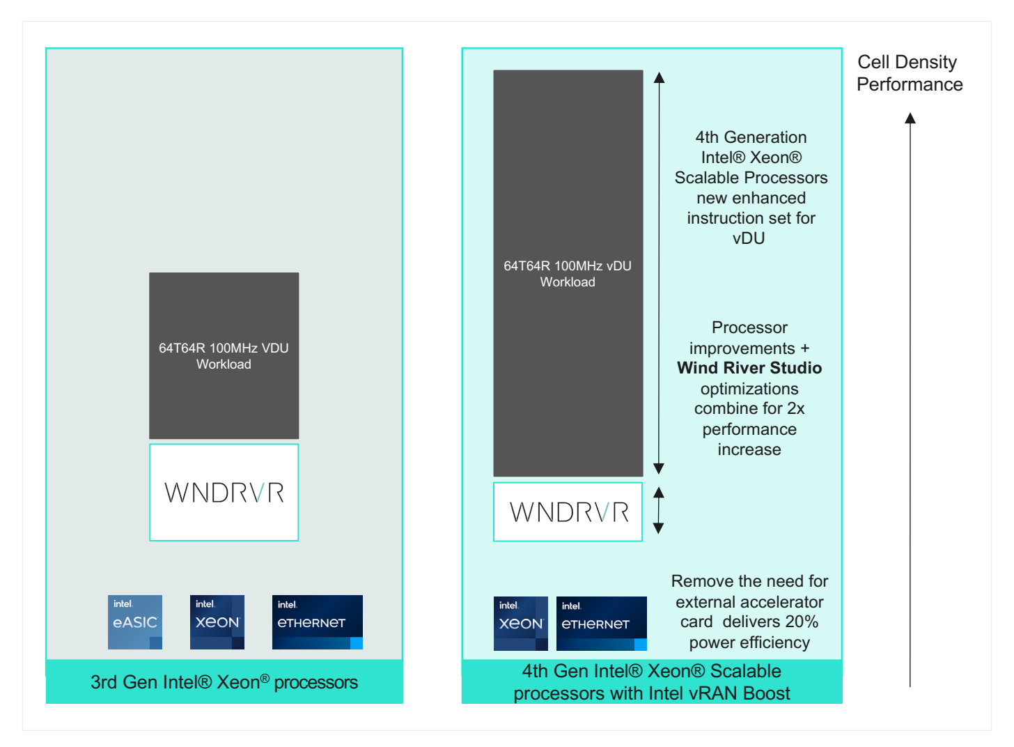
Figure 5. Performance results from the Wind River Studio tests (higher is better) The 3<sup>rd</sup> Gen Intel<sup>®</sup> Xeon<sup>®</sup> Scalable processors support 20 radios on two cores, whereas the 4<sup>th</sup> Gen Intel<sup>®</sup> Xeon<sup>®</sup> Scalable processor supports 32 radios on one core.

Studio Conductor was used to deploy the workload that ran on each of the servers. The workload was run on each of the servers in parallel which then measured the performance. The platform and workload performance KPIs were collected by Wind River Studio Analytics in real time from the two subclouds, brought to the central region and displayed side by side on a Kibana dashboard showing the performance gain and platform overhead reduction running the exact same workload on both SUTs.