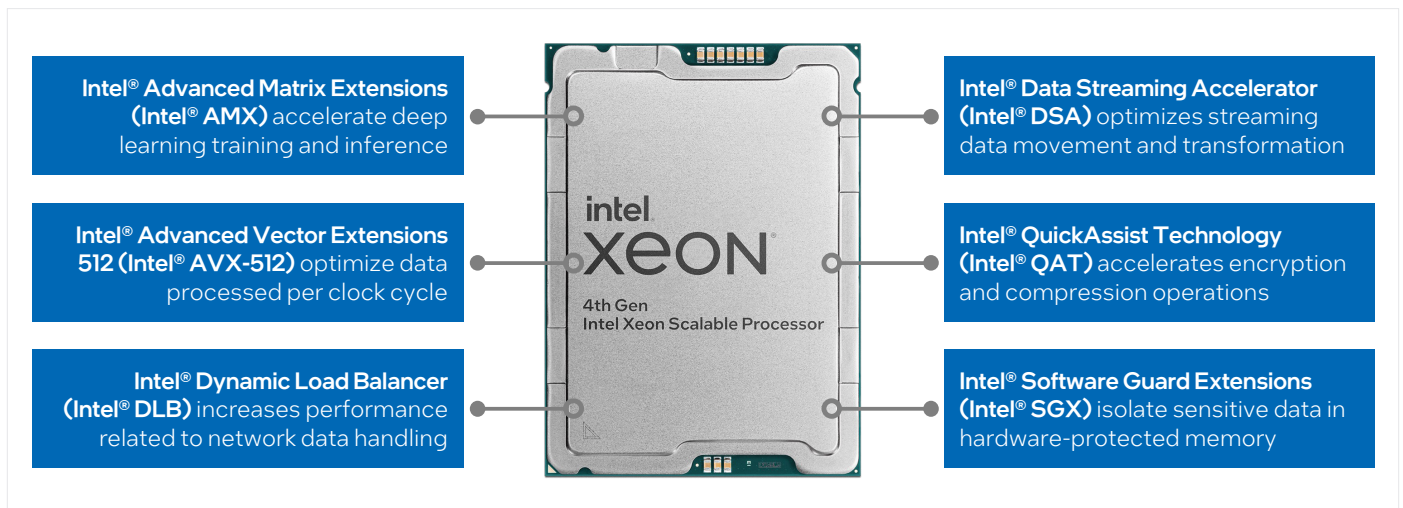
Figure 2. The 4th Gen Intel Xeon Scalable processor features six accelerators and up to 52 cores for performance.

Additionally, Intel® Advanced Vector Extensions 512 (Intel® AVX-512) is an instruction set that can accelerate performance for the most demanding computational workloads. For cable MSOs, Intel AVX-512 accelerates cyclic redundancy check (CRC) calculations, a function that is required for every network packet.